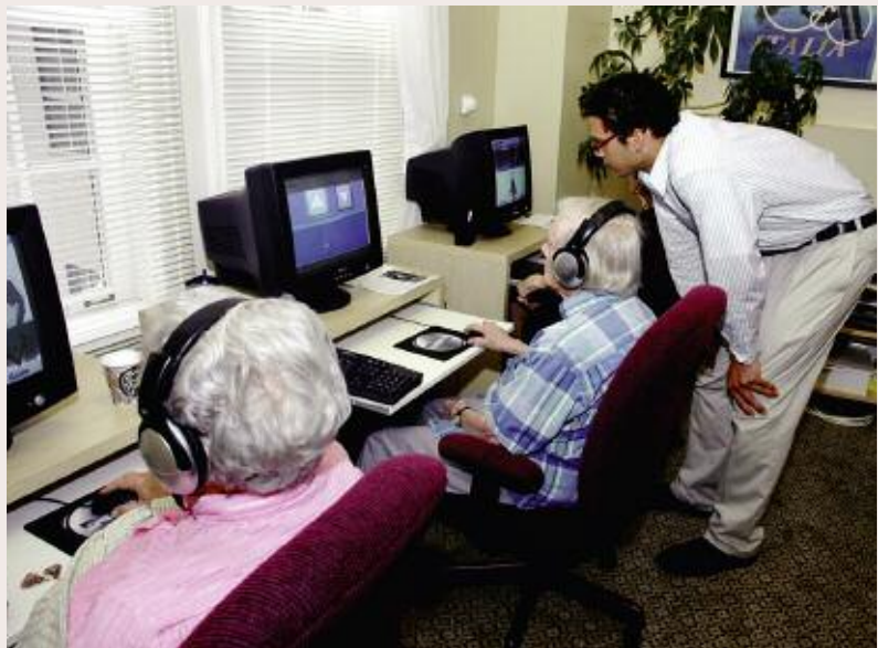
Figure 1. The Brain Fitness Program is a series of computer-based exercises designed to improve important brain functions.