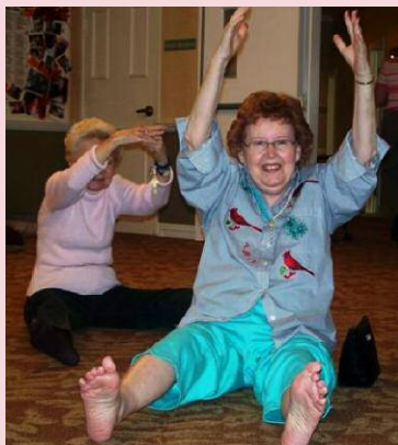
Figure 3. Silverado residents participate in yoga classes.