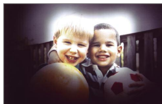
Figure 2. A person with glaucoma loses vision around the periphery first.