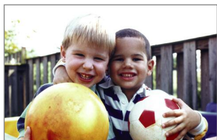
Figure 1. A person with normal vision sees this.

Glaucoma is a group of diseases that can permanently damage the optic nerve. The most common form is primary open-angle glaucoma (PAOG). There are no symptoms or pain associated with the onset of glaucoma. As the disease progresses, side vision may begin to fail (Figures 1 and 2). Objects straight ahead may be clear, but objects to the side might be missed. If left untreated, the field of vision narrows considerably until objects in the front can no longer be seen and blindness results. An estimated 2.2 million Americans have been diagnosed with PAOG, and an additional 2 million have glaucoma and don't know it.