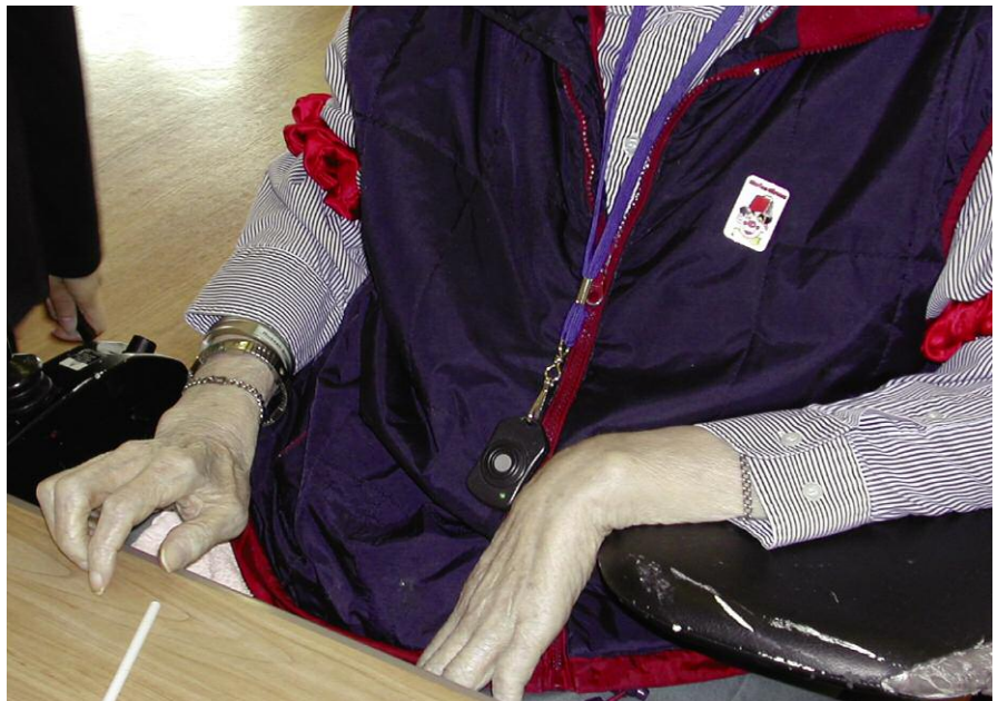
Figure 2. An emergency response necklace.

The traditional technology for personal emergencies is a nurse call system in each resident's room with a fixed pull cord or push button by the bed and perhaps in the bathroom. These systems are widely used in the LTC market and are, in fact, usually a regulatory requirement. However, nurse call systems are not ideally suited to the AL market because residents have no means to call for help outside of their rooms.