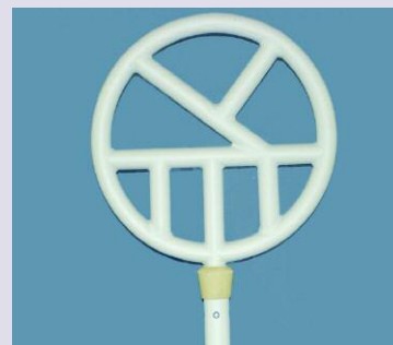
Figure 1. Halo Safety Ring

Ring, which utilizes a 3 lateral mattress stay on the opposite end of the transfer bar, eliminates compressibility factors by permanently pushing the upper portion of the mattress up against the Halo Safety Ring, maintaining compliance with the 2½ inch guidelines in zones 2, 3, 4 and 5, if zone 5 is now defined as the space between the headboard and the beginning of the Halo Safety Ring. The positioning of the Halo Safety Ring 12½ inches or more from the head of the bed allows for compliance with the HB-SW guidelines while creating a viable exit point for residents.